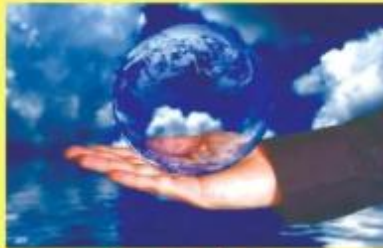
पाणी वाचवा, जीवन वाचवा