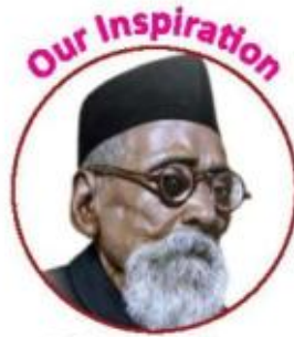
Bharat Ratna Maharshi D. K. Karve