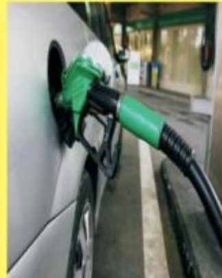
इंधन वाचवा, पैसे वाचवा