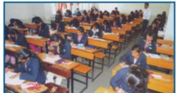
Well equipped digital class rooms